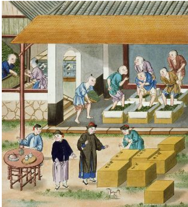
"Packing in Chests" from Tea Production Album , Guangzhou, China, c. 1790. Gouache and watercolors, Chinese paper, and silk. Album: overall: 13 1/2 x 12 1/8 x 1 in. (34.29 x 30.7975 x 2.54 cm). 56.428.Historic Deerfield, Inc., Deerfield, Massachusetts.

Join us for the Exciting CCC 2023 Seminar via Zoom!