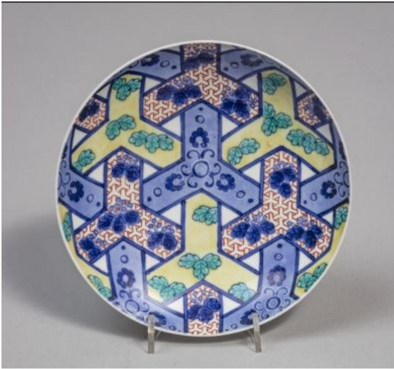
Dish with Ajiro Design , Hizen, Japan, Porcelain with underglaze blue and overglaze enamels, circa 1680. Overall 1 9/16 x 5 7/8 in. (4 x 15 cm.). The Gardiner Museum, Toronto, Promised Gift from the Macdonald Collection.