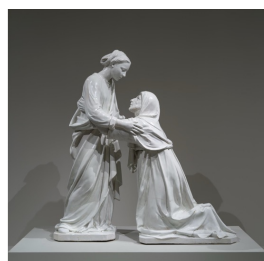
The Visitation , Luca della Robbia, about 1445, Church of San Giovanni Fuorcivitas, Pistoia