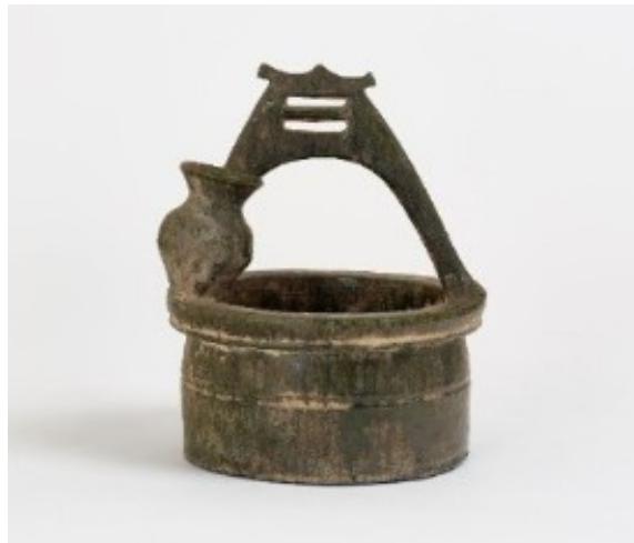
Well-head , Han Dynasty, 206 B.C. to 220 A.D., earthenware, with green glaze. Kykuit, National Trust for Historic Preservation, bequest of Nelson A. Rockefeller.