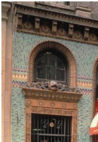
American Encaustic Tiling Company Building, 16 East 41 st Street, New York City. 1908, terra cotta.