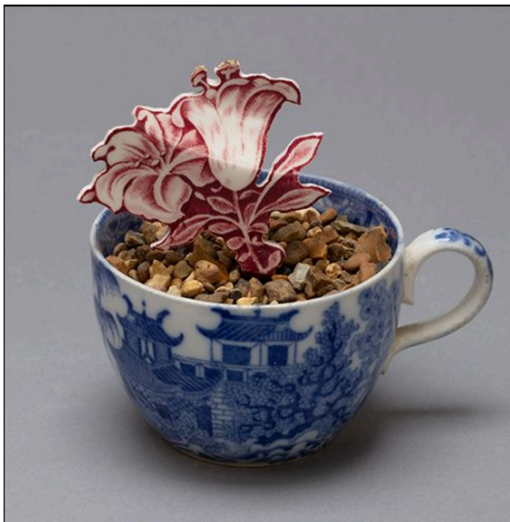
Cumbrian Blue(s), Flower Cup No:4. Paul Scott 2021. Cut detail from Enoch Wood & Sons Castles pattern plate (c. 1930), in transferware cup c. 1820, H. 4 5/16" (h. 11cm). Maureen Michaelson Collection.

For a look at the beautiful examples of English porcelain offered in the sale, go to https://www.bonhams.com/auctions/27326/ .