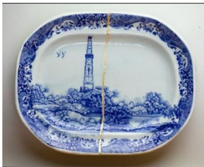
Cumbrian Blue(s), New American Scenery, Fracked, No:1, 2021 , Paul Scott 2020. In-glaze screen print (decal) collage, on repaired pearlware platter (after Enoch Wood) kintsugi and gold leaf, L. 15 \frac{3}{8} " x W. 12" (39cm x 30.5cm x 5cm). Italian border pattern decals salvaged from the abandoned Spode Factory, July 2009.

https://us02web.zoom.us/webinar/register/WN_fcj4npM_Rtu072kLiVQwtg