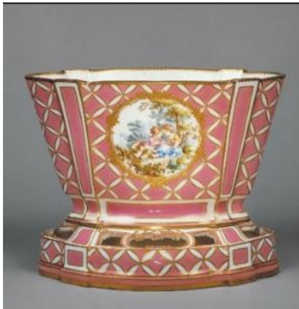
Vase 'hollandois', Manufacture de Sèvres, 1758. The Wallace Collection, London