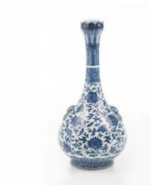
Blue and white Lotus-mouth Bottle Vase, China, possibly 18th-century with six character Yongzheng mark