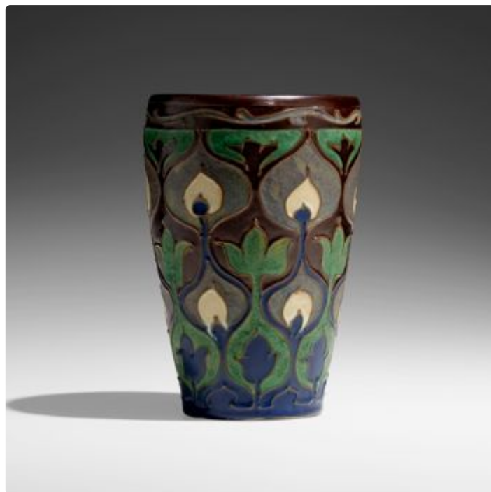
Vase, Frederick Hurten Rhead, Arequipa Pottery, 1912. Glazed squeezebag-decorated earthenware, H. 7½ in. × Diam. 5 in (19 × 13 cm)