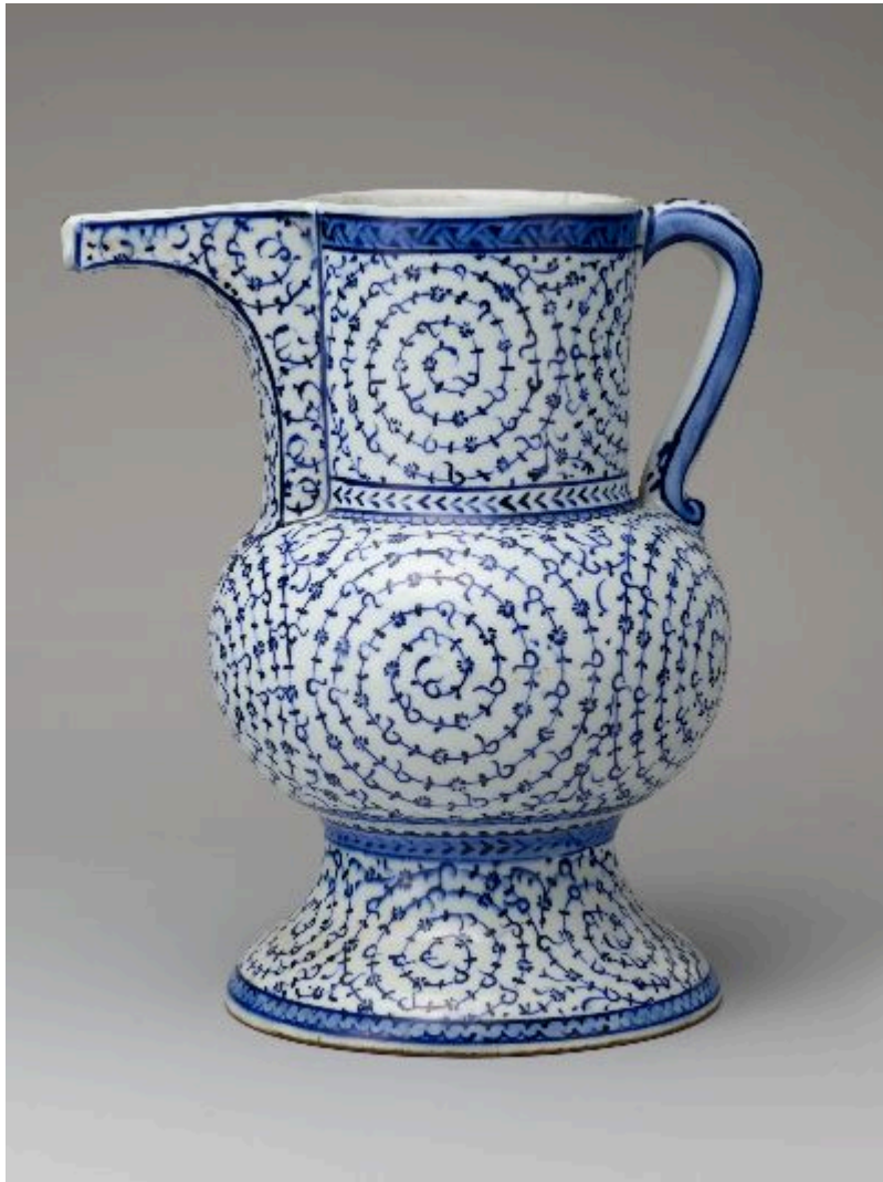
Ewer with 'Tughra-illuminator' Style Decoration, 1525-40, from Turkey, Iznik; stonepaste painted in blue under transparent glaze. H. 8 13/16 in. (22.4 cm); W 7 7/16 in. (18.9 cm). The Metropolitan Museum of Art, New York, Harris Brisbane Dick Fund, 1966 (66.4.3a,b).