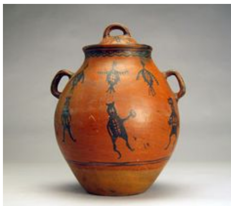
Unknown maker (Tesuque), Bean Jar , ca. 1885. Earthenware, 12 1/4 x 11 (diam.) in. Crocker Art Museum, gift of Loren G. Lipson, M.D., 2017.54.

https://us02web.zoom.us/webinar/register/WN_eCGliUCLQjKHEBykisS7qQ