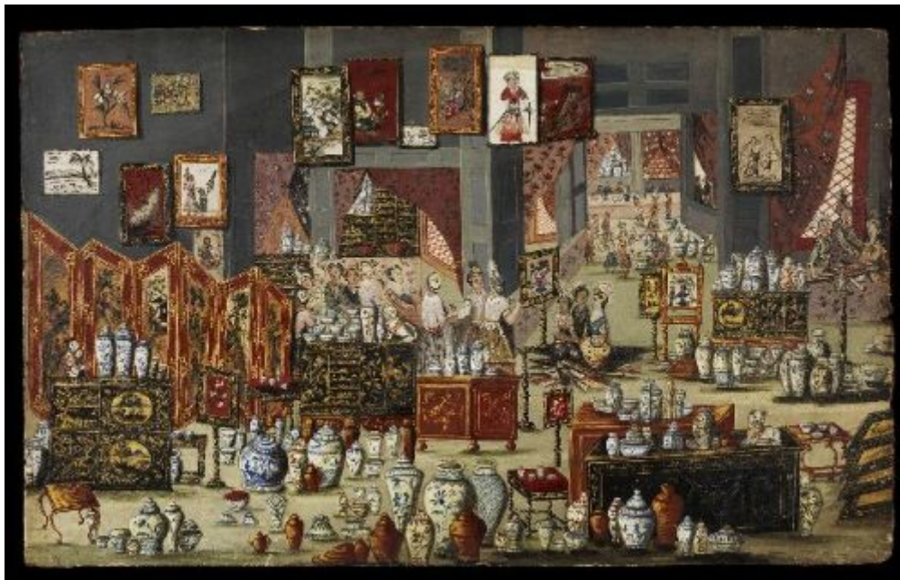
Interior of a Chinese Shop (image originally part of fan leaf), Netherlands, 1680-1700. H. 10 ¼ in (26.3